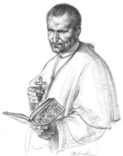
© S. ALFONSO M. DE LIGUORI